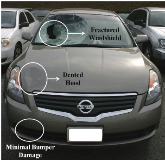
Figure 3: Forward projection impacts generate a typical damage pattern that includes front bumper damage, a dented hood, and a fractured windshield.

the damage is usually more localized. In dragging/run-overs, blood and biological matter are often found on the vehicle's undercarriage and tires, as well as along the roadway surface.